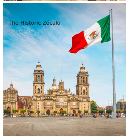
The Historic Zócalo

We will depart Puebla for Mexico City Airport to board flight AA502 at 3:25 p.m., arriving in Phoenix at 5:50 p.m.